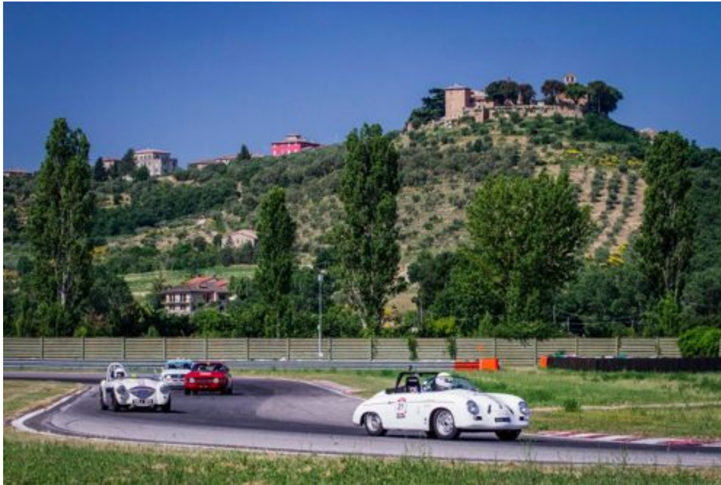
( http://dktp7u7ukm41y.cloudfront.net/wp-content/uploads/2016/04/Cento-Ore.jpg )

( http://collectorscarworld.com/news_category/dealer/ )