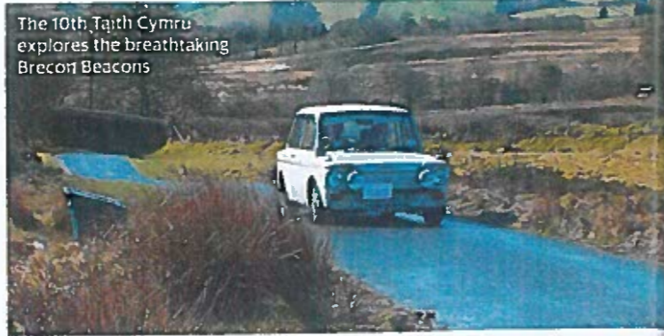
The 10th Taith Cymru explores the breathtaking Brecon Beacons

9 RB Taith Cymru One of the Historic Rally Car Register's most scenic tours. This trip around the best bits of South Wales starts and ends in Crickhowell and takes in 140 miles up as far as Devil's Bridge in Ceredigion. £85 per car, including bacon rolls and coffee. Email taithcymru@aol.com , 02920 751707, 07872 351179