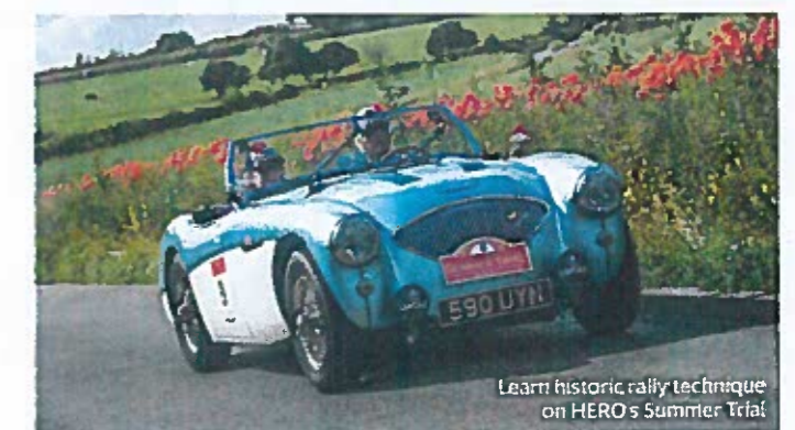
Learn historic rally technique on HERO's Summer Trial

6-11 Modena Cento Ore Classic A stunning top-end event for sports cars and two-seat racing cars with FIA HTP papers. Five days, three circuit races and a dozen hillclimbs, all focused on Modena's most famous cars and their period rivals. There's also a regularity option for those not wishing (or not licensed) to race, but all get together each evening in luxurious surroundings. €6500/€6000 per crew. modenacentooreclassic.it , 00 39 0522 451899