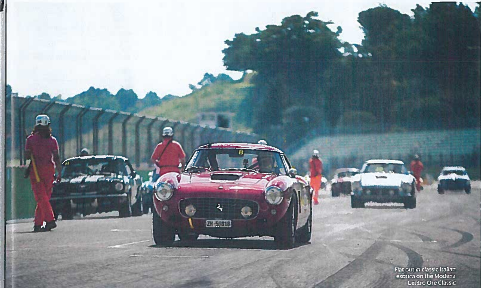
Flat out in classic Italian exotica on the Modena Centro Ore Classic

spend a fortnight enjoying your old car. £2950 per person based on two people sharing. countrylanetours.co.uk , 01824 790280